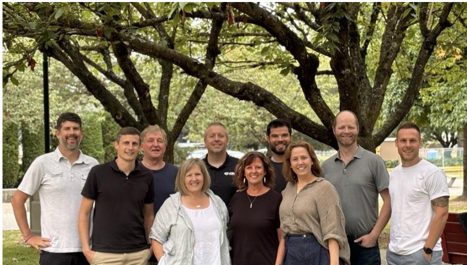
Student Development Team

Please don't hesitate to contact us at studentdev@columbiabc.edu if you have any questions!